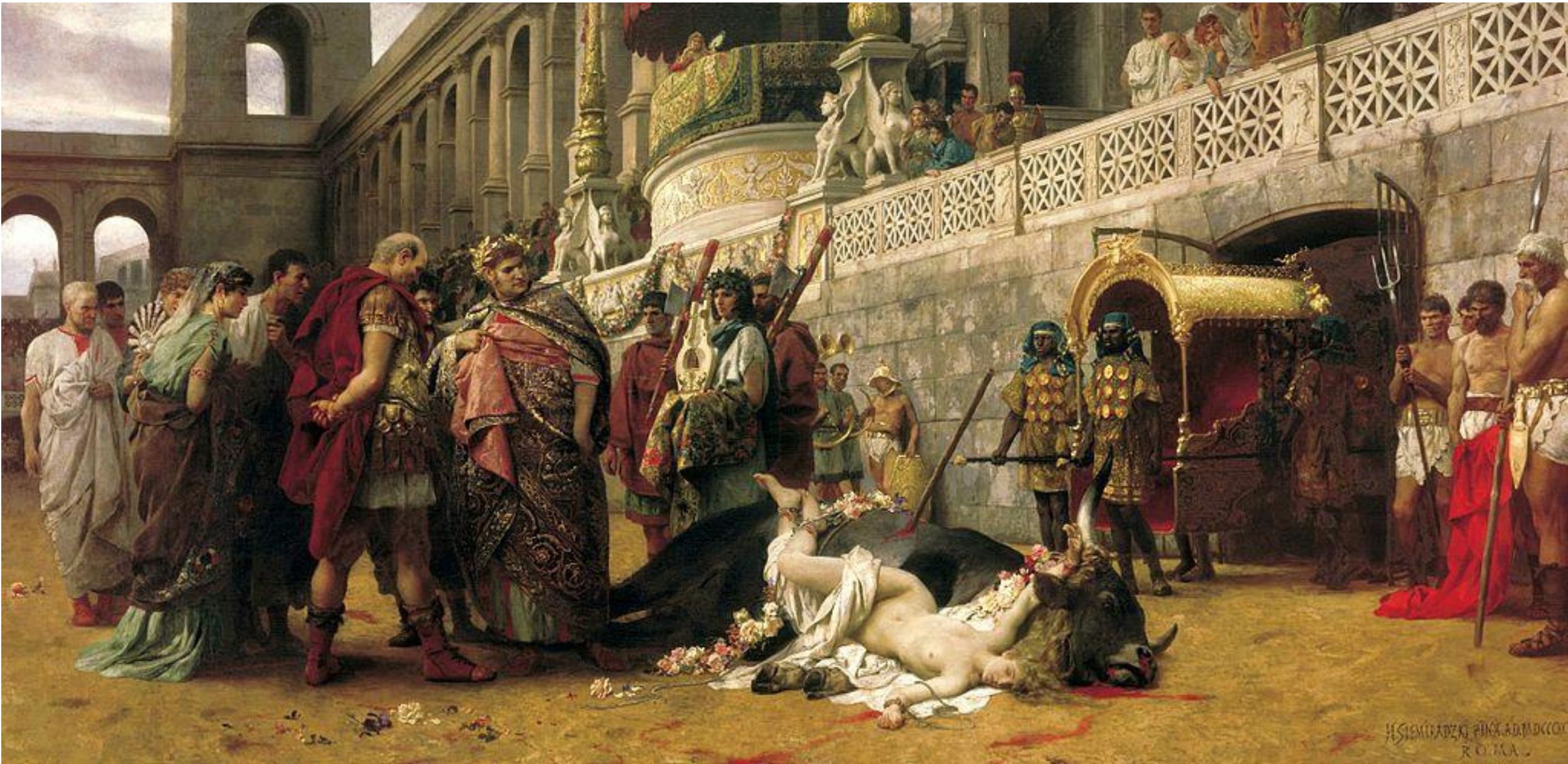
Christian Dirce (Henryk Siemiradzki) shows the punishment of a Roman woman who had converted to Christianity(1897)