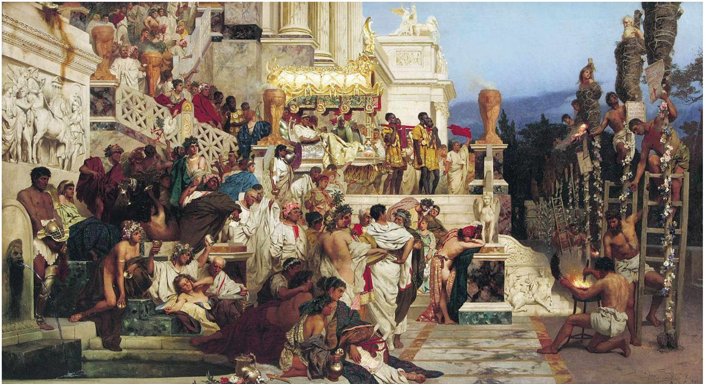
Source: Nero's Torches (Christian Candlesticks) by Henry Siemiradzki, 1876