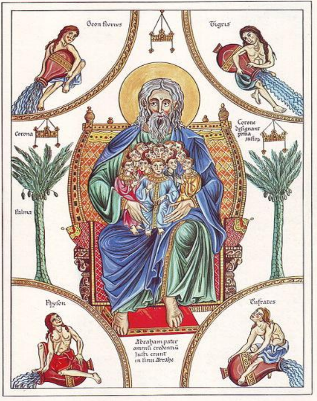
Depiction of Abraham circa 1180 by Herrad von Landsberg