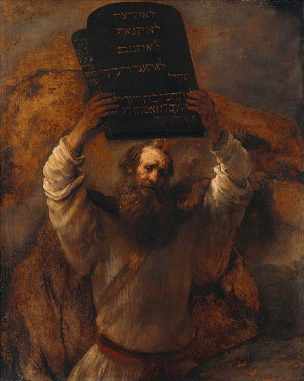
Moses with the Tablets of the Law. Rembrandt, 1695.