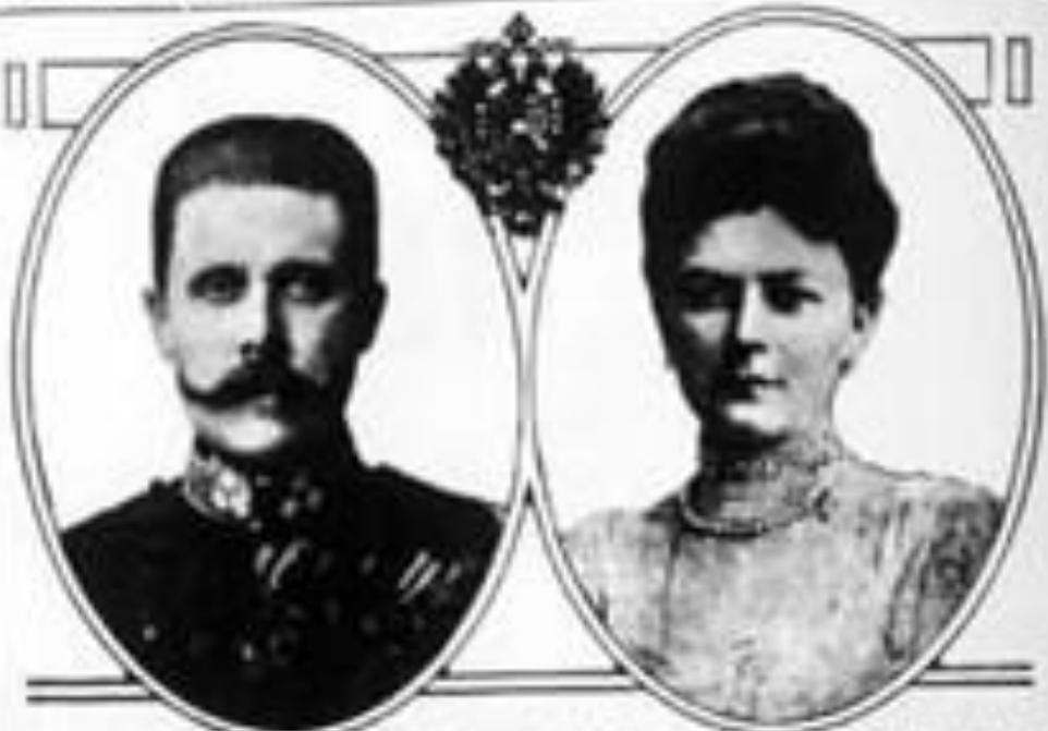
Archduke Francis Ferdinand and his Consort the Duchess of Salsburg Slain by Assassin's Bullets.

News item in the New York Times (1914) about the assassination of Archduke Francis Ferdinand, heir to the throne of Austria-Hungary, and his wife, the Duchess of Salsburg, near Sarajevo, Bosnia, on June 28, 1914. The text describes the assassination attempt, the role of the assassin Gavrilo Princip, and the political implications of the event.