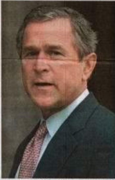
As a uniter, not a divider, George W. Bush appears to be the most promising. The court's decision is a surprise, as many analysts expected a 5-4 vote in favor of a recount.

As a uniter, not a divider, George W. Bush appears to be the most promising. The court's decision is a surprise, as many analysts expected a 5-4 vote in favor of a recount. The court's ruling is a major victory for George W. Bush, who leads in the electoral college. The court's ruling is a surprise, as many analysts expected a 5-4 vote in favor of a recount.