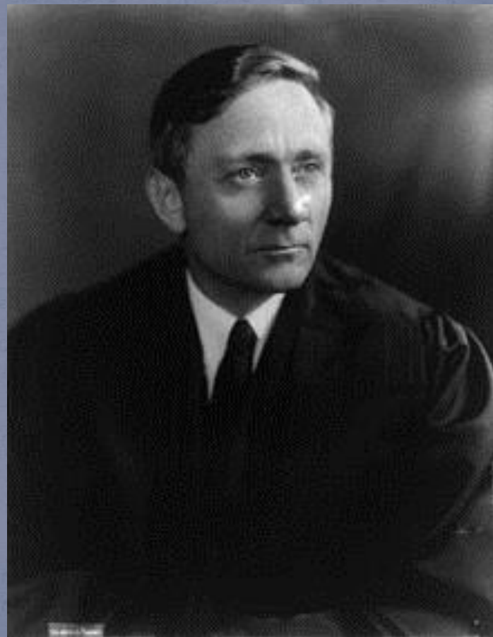
William O. Douglas 1939-1975