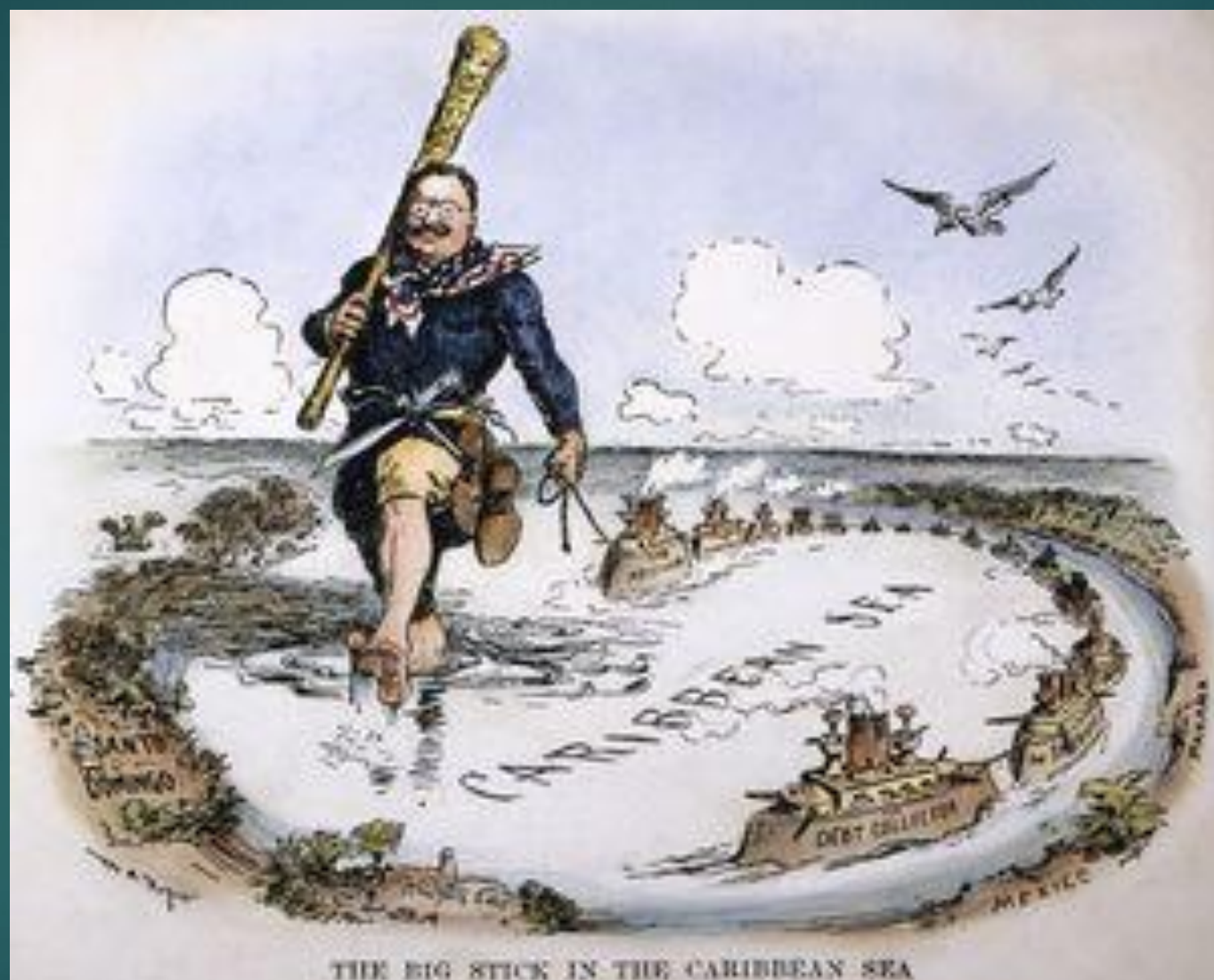
THE BIG STICK IN THE CARIBBEAN SEA