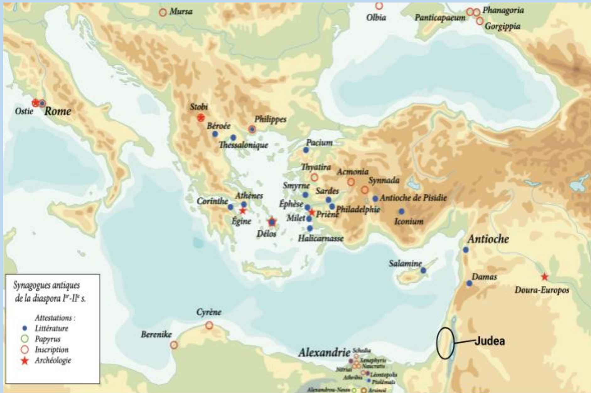
A map illustrating the location of synagogues in antiquity (1st-11th century CE). Each circle or star represents a location where there is some evidence of the existence of a Jewish temple created as a