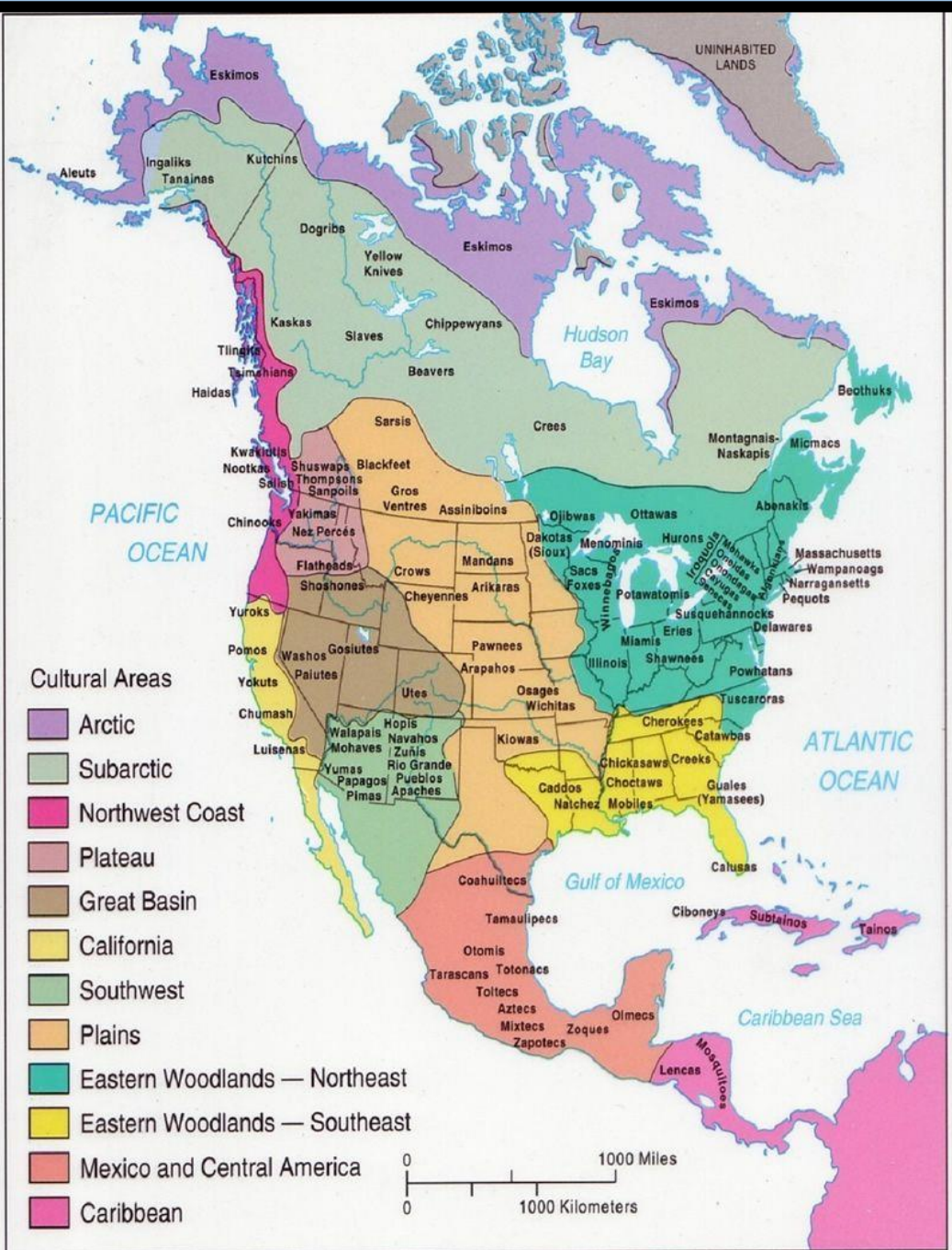
North America in 1450